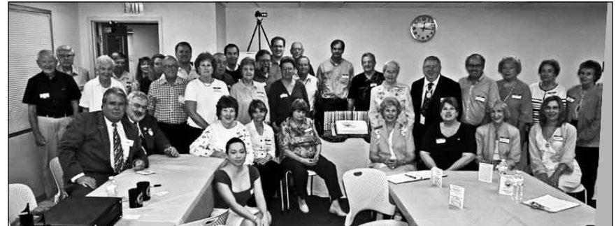
Mayflower Group at the Family History Library in West Los Angeles.