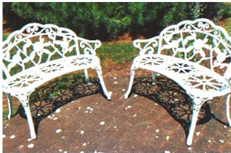
Benches in Plymouth Rose Garden Meeting

The San Joaquin Valley Colony bought two garden benches to be placed in a conversational manner in the Rose Garden at Plymouth headquarters. We also bought a brick for the walkway there. Although we have close to 80 members, our attendance at meetings has dwindled. We have a lovely following of non-members which rounds out our meetings to 15 to 20 attenders. However, this last meeting had only 4 members in attendance. The nominating committee has not found a person to fill the Secretary position. Our next meeting will be May 5, 2018. We hope to have a new website up and running sometime this winter, as no-one has been able to get into the Rootsweb site since 2013. A February board meeting will tackle some of these difficulties and write up our plan for a scholarship, so students may apply.