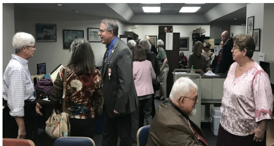
Board has a chance to check out the library

The October 21, 2017 Board of Assistants meeting was the first board meeting to be held in the new library location. It was a very well attended meeting and also an opportunity to get our business done and check out the library too. If you have a chance to go to the CA Mayflower Library in Oakland, I think you will appreciate the new facilities. The address is 2201 Broadway, Suite LL13, Oakland, CA.