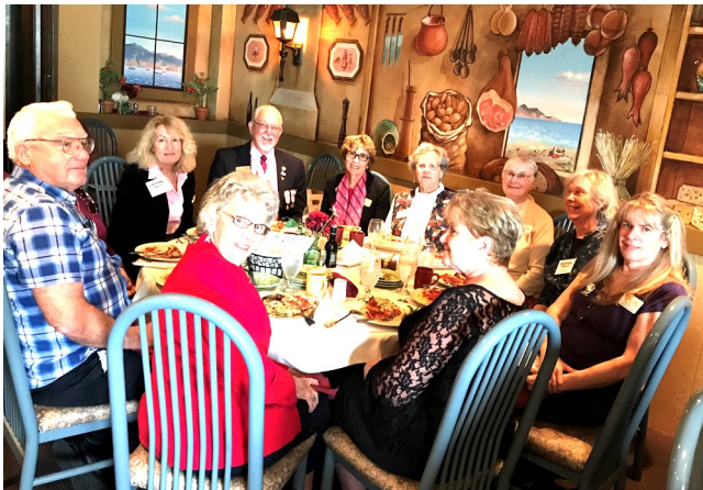
Members and guests enjoying lunch