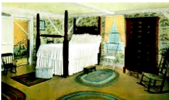
Alden House Bedroom

Elizabeth Alden Pabodie (Peabody), was allegedly the first white woman born in New England in 1623. She married William Pabodie, a civic and military leader of Duxbury on December 26, 1644. All of their thirteen children were born in Duxbury before William and Elizabeth eventually