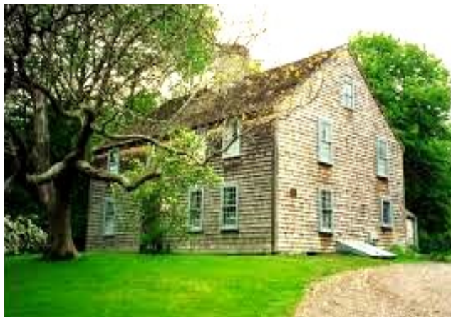
Alden House, Duxbury, MA

John Alden (b.1599, d. 12 Sept. 1687) was a crew member on the 1620 voyage of the Mayflower . Also, he was one of the founders of the Plymouth Colony and the seventh signer of the Mayflower Compact . It is not clear as to who his parents were, but we know John Alden was not a Pilgrim, but