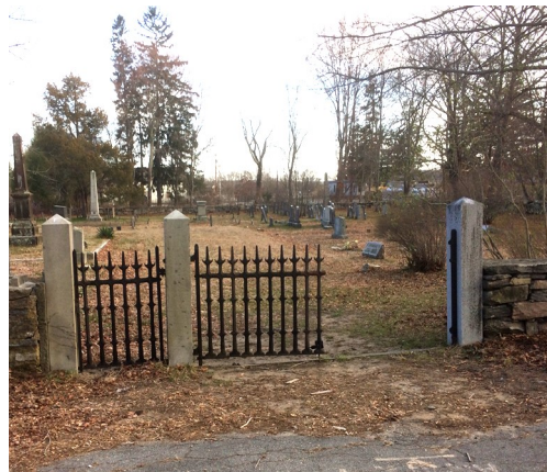
The Historic Brewster Neck Cemetery