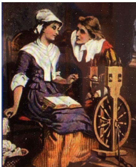
“Speak for yourself John”

While the story is not verifiable, many do believe it in fact happened. Shortly after arriving in the New World, Standish, “a blunt old captain, a man not of words, but of action,” according to Longfellow, took a liking to Mullins, “the loveliest maiden of Plymouth.” However, although Standish was fearless in battle, he was too shy to confront Mullins directly, so he sent his young