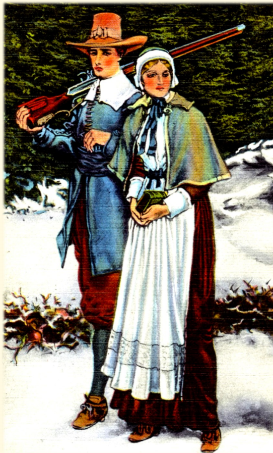
John Alden & Priscilla Mullins Alden

Published by the Society of Mayflower Descendants in the State of California Winter 2018, Volume XLII Number 1