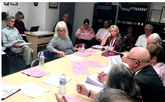
The Board at work

The California Mayflower Society shared in hosting an open house of our new library location with members of the California Genealogical Society whose offices and library are across the hall from each other. The Genealogical Society presented a beautiful cake, finger foods and drinks. It was a good time of sharing between both societies whose goals are similar, to assist people to research their ancestors.