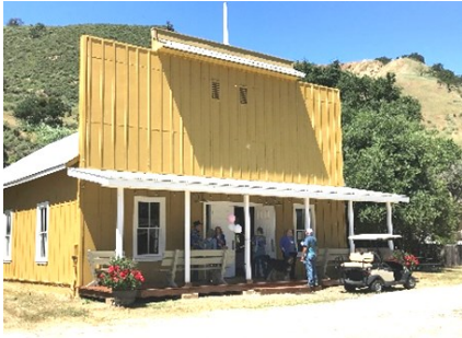
Dunneville Dance Hall