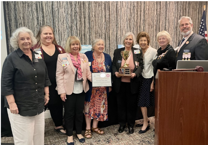
Orange County Colony Members accepting trophy

Our thanks also go all the colonies throughout the state for the contributions made by our members during 2021-2023. With all the great talent and enthusiasm in our state society, we have no doubt that we will keep our pilgrim story alive and well and help to dispel myths that have developed over the years.