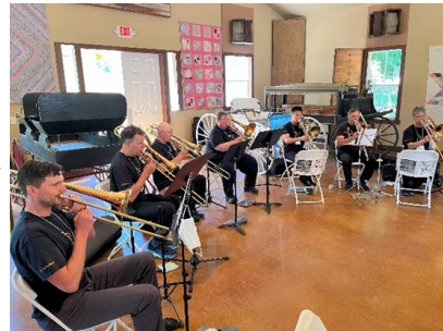
South Bay Trombone Choir