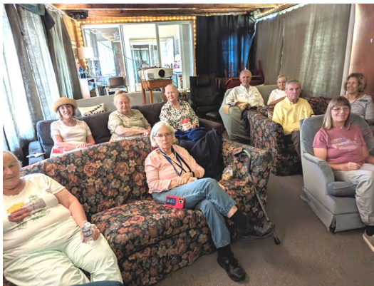
Garden Room Theater screening of "Stephano"