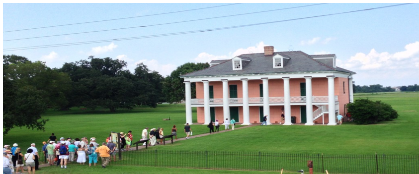
Mayflower Tour Group of Chalmette Battlefield Site of Andrew Jackson's 1815 Victory in the War of 1812