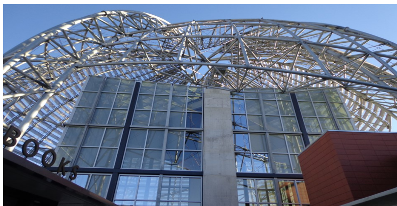
New SD Central Library Dome