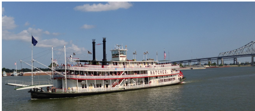
Mississippi Paddle Wheeler . Mayflower Group Tour to Chalmette Battlefield