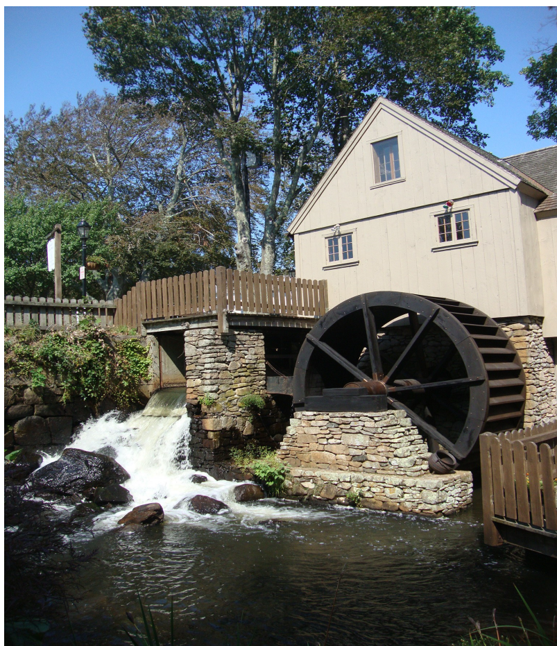
Jenney Grist Mill, Plymouth, MA

A quarterly newsletter published by the Society of Mayflower Descendants in the State of California Fall 2013, Volume XXXVII, Number 4