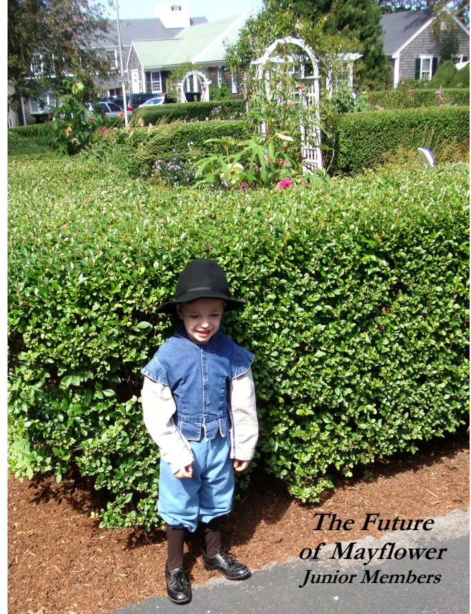
The Future of Mayflower Junior Members

A quarterly newsletter Published by the Society of Mayflower Descendants of California Summer 2012, Volume XXXVI, Number 5